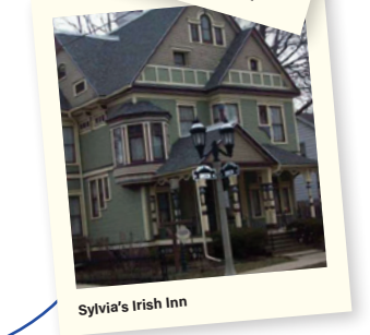
Sylvia's Irish Inn