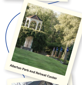
Allerton Park and Retreat Center