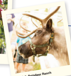
Hardy's Reindeer Ranch