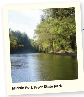
Middle Fork River State Park