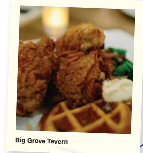
Big Grove Tavern