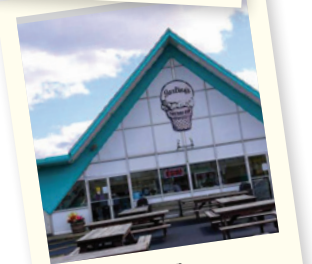
Jarling's Custard Cup