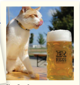
Riggs Beer Company

Many attractions have reopened with limited capacity or different operating hours. Inquire with attractions ahead of time for up-to-date travel policies and health and safety information.