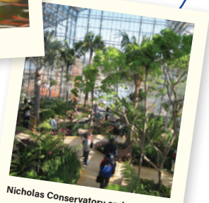
Nicholas Conservatory and Gardens