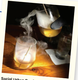
Social Urban Bar & Restaurant

Many attractions have reopened with limited capacity or different operating hours. Inquire with attractions ahead of time for up-to-date travel policies and health and safety information.