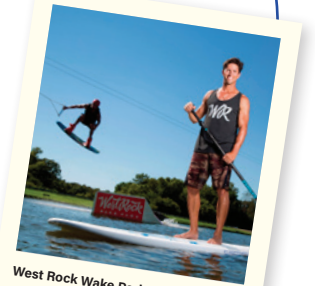
West Rock Wake Park