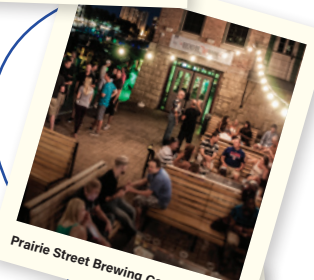
Prairie Street Brewing Co