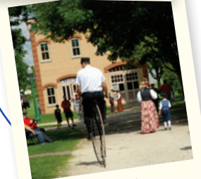
Midway Village Museum