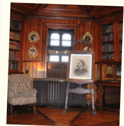
Tinker Swiss Cottage Museum and Gardens