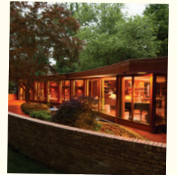
Frank Lloyd Wright - Laurent House

A trip to the Rockford region would not be complete without a stop at the fascinating Tinker Swiss Cottage Museum and Gardens . This historic house museum is accompanied by their barn, and carriage house from the Tinker family. Filled with original furnishings, artwork, diaries, clothing and household items, the Cottage is a rich time capsule of life during the Victorian Era. The Cottage is also one of only a handful of Swiss-style homes remaining in the United States.