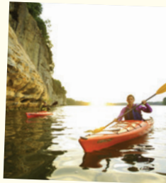
Buffalo Rock State Park