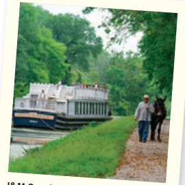
I&M Canal Boat Ride