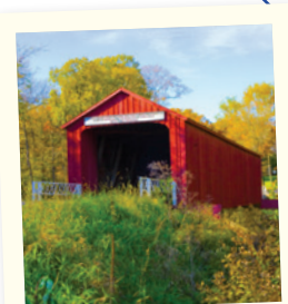
The Red Covered Bridge