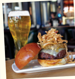
The Lone Buffalo