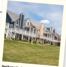
Heritage Harbor Marina Resort