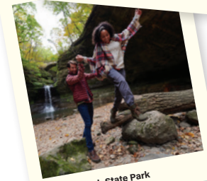
Starved Rock State Park