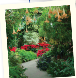
Luthy Botanical Garden

Many places have reopened with limited capacity, new operating hours or other restrictions. Inquire ahead of time for up-to-date health and safety information.