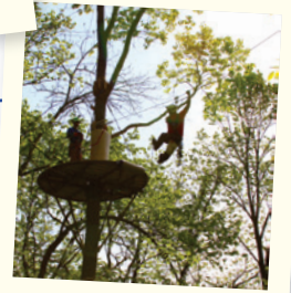
Long Hollow Canopy Tours