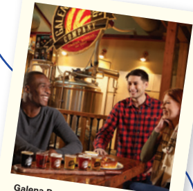
Galena Brewing Company