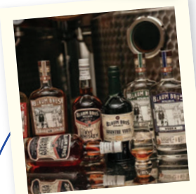
Blaum Bros Distilling Co