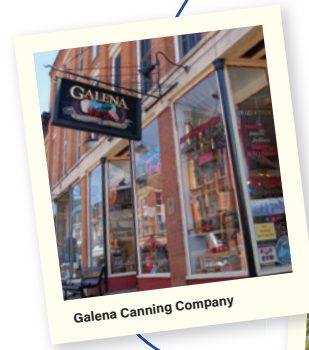
Galena Canning Company