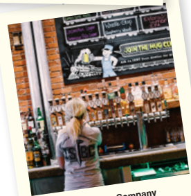
Iron Spike Brewing Company