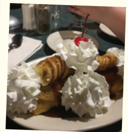
Landmark Cafe & Creperie