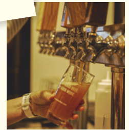
Knox County Brewing Company

Many attractions have reopened with limited capacity or different operating hours. Inquire with attractions ahead of time for up-to-date travel policies and health and safety information.