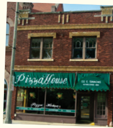
The Pizza House