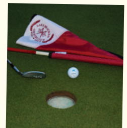
Lake Bracken Country Club

To begin your final day in Galesburg, get your fill of delicious and savory crepes from the Landmark Cafe & Creperie . From there, head to Lake Storey for a day filled with kayaking, canoeing or fishing. Constructed in 1927 so locomotives would have soft water to run through them, Lake Storey is the perfect place to spend your day. Home to channel catfish, walleye and muskie, Lake Storey is great fun for the avid fisherman.