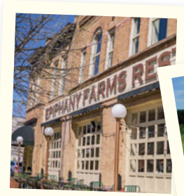
Epiphany Farms Estate