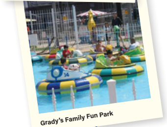
Grady's Family Fun Park