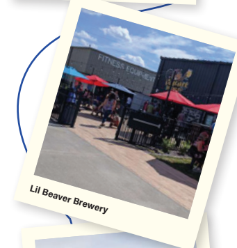
Lil Beaver Brewery