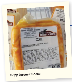
Ropp Jersey Cheese