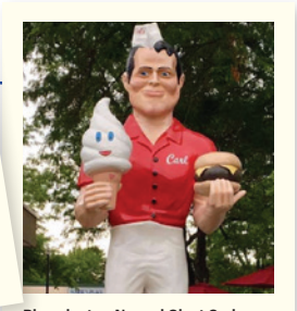
Bloomington-Normal Giant Carl

Many attractions have reopened with limited capacity or different operating hours. Inquire with attractions ahead of time for up-to-date travel policies and health and safety information.