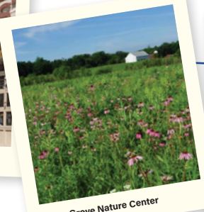
Sugar Grove Nature Center